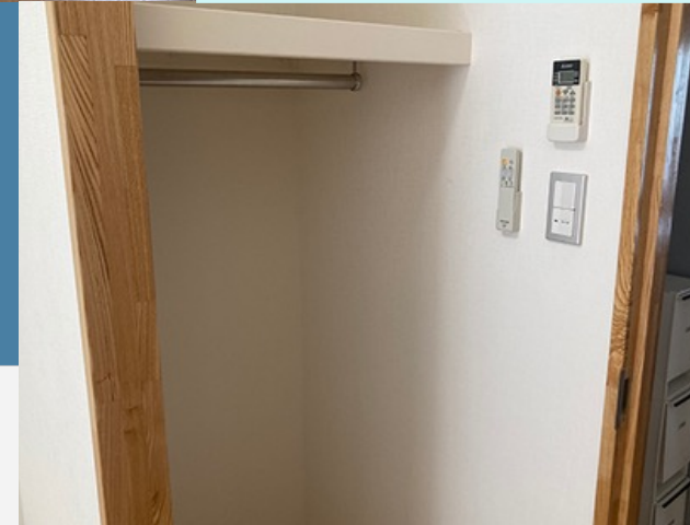
Private room & closet