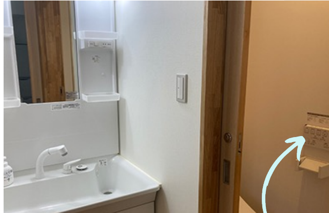
Bathroom & toilet