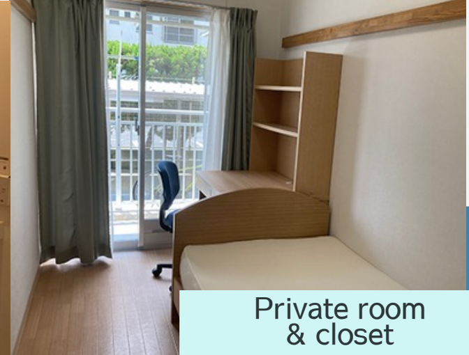
Private room & closet